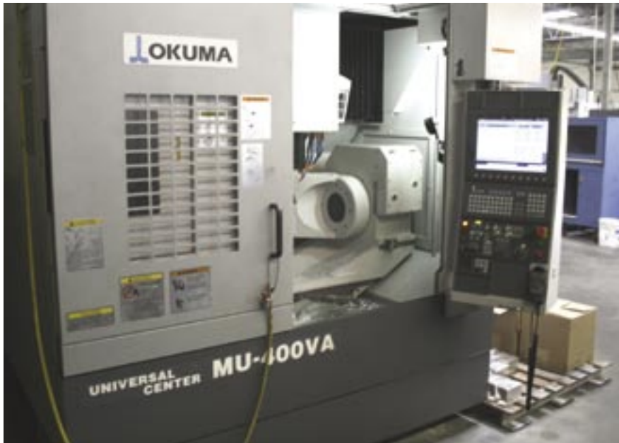
Above: A new Okuma MU-400VA 5-axis machining center at R&S Machining.