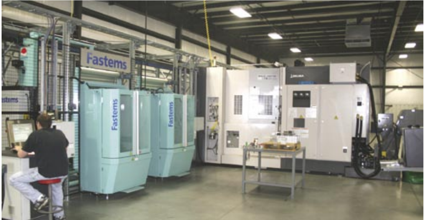
Above: One of C.E. Machine's crew is dwarfed by the new Okuma Fastems FMS horizontal machining cell. Purchased through Hartwig, it features 48 pallets, 50-tool magazine with tool management software and a 12,000-rpm spindle.

C.E. Machine Company, Wichita, Kansas, has recently installed an Okuma MA500HB with a Fastems FMS.