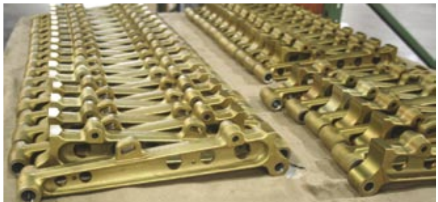
Above: Examples of the machining work performed at C.E. Machine.

The new Okuma Fastems FMS horizontal machining cell, purchased through Hartwig, Inc., features 48 pallets, 50-tool magazine with tool management software and a 12,000-rpm spindle.